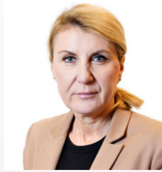
JELENA DRENJANIN Member of the European Committee of the Regions, Huddinge municipality