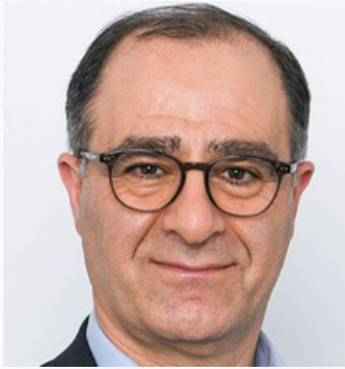
ILAN DE BASSO Member of the European Parliament