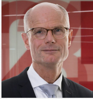
STEF BLOK Member of the European Court of Auditors from the Netherlands.